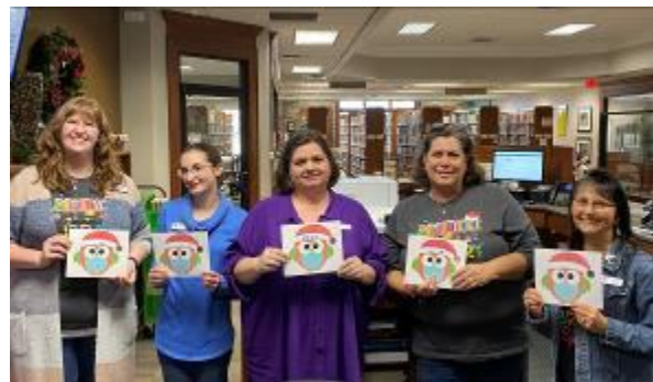
FOUCL gifted UCPL staff with Aldi's Gift Cards at Christmas.